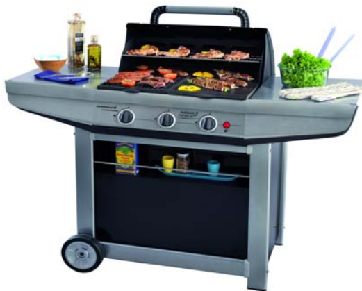
ADELAÏDE 3 PREMIUM