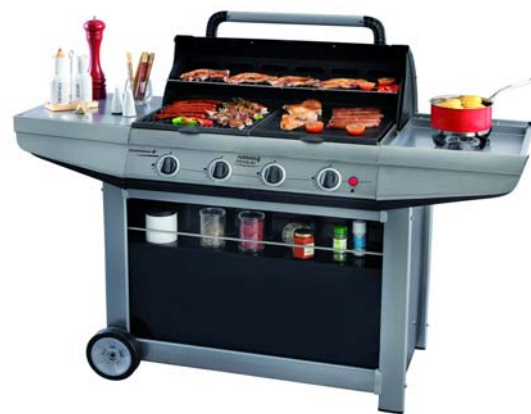
ADELAÏDE 4 PREMIUM DELUXE