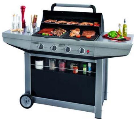
ADELAÏDE 4 PREMIUM