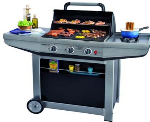
ADELAÏDE 3 PREMIUM DELUXE