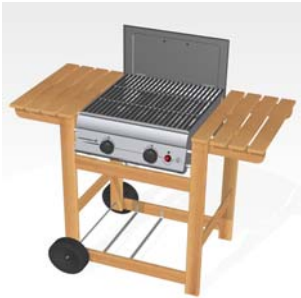
ADELAÏDE 2 WOODY