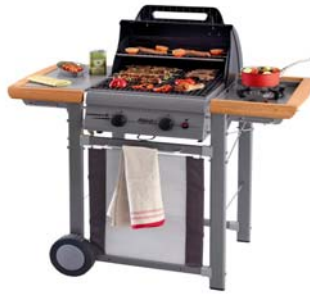
ADELAÏDE 2 CLASSIC L DLXE