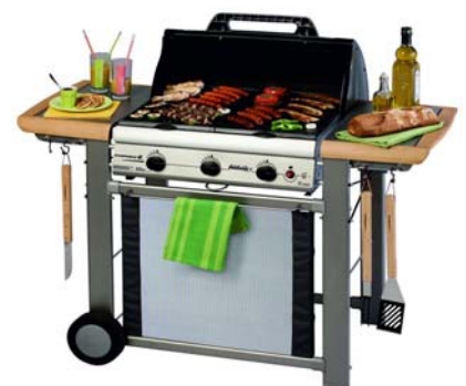
ADELAÏDE 3 CLASSIC L DELUXE