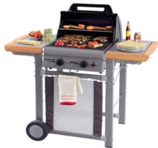
ADELAÏDE 2 CLASSIC L