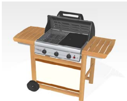
ADELAÏDE 3 WOODY L