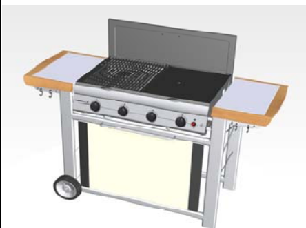
ADELAÏDE 4 CLASSIC