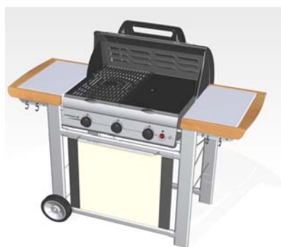
ADELAÏDE 3 CLASSIC L