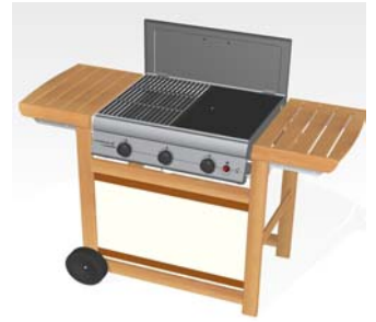
ADELAÏDE 3 WOODY