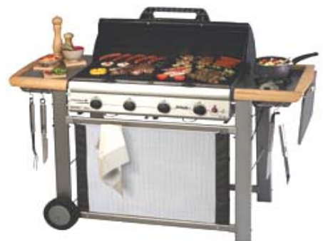
ADELAÏDE 4 CLASSIC L DELUXE