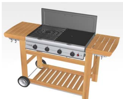
ADELAÏDE 4 WOODY