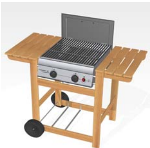
ADELAÏDE 2 WOODY