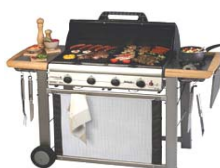
ADELAÏDE 4 CLASSIC L DELUXE