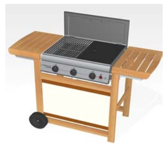
ADELAÏDE 3 WOODY