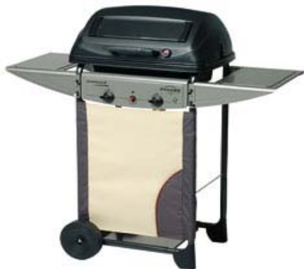
2 PLUS & SUPER