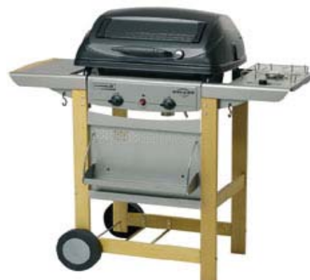
WOODY ADVANTAGE DE LUXE