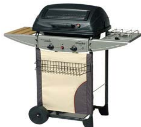
DELUXE & LUXE