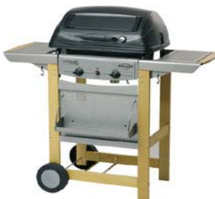
WOODY ADVANTAGE & VENTURA WOODY