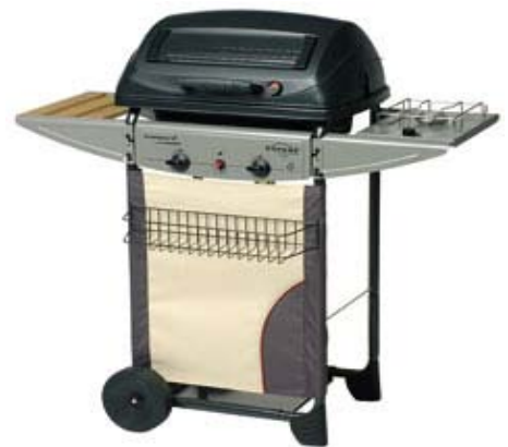
DELUXE & LUXE