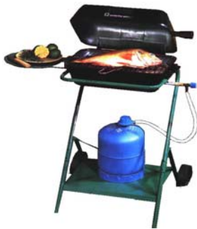
GRILL 4002 5000

TO ADAPT THE BURNER, IT IS NECESSARY TO ENLARGE BOTTOM OPENING ORIFICE DE PASSAGE DANS LA CUVE A MODIFIER POUR ADAPTER LE BRULEUR