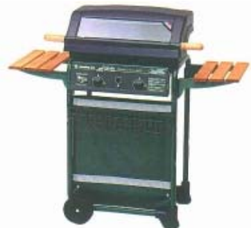
9000 - 4 SUPER

FOR SIDE STOVE, CF. SPECIFIC SCHEME POUR RECHAUD LATÉRAL, VOIR ECLATE SPECIFIQUE