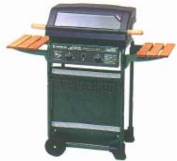
9000 - 4 SUPER

FOR SIDE STOVE, CF. SPECIFIC SCHEME POUR RECHAUD LATÉRAL, VOIR ECLATE SPECIFIQUE