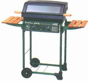
9000 - 4 CLASSIC