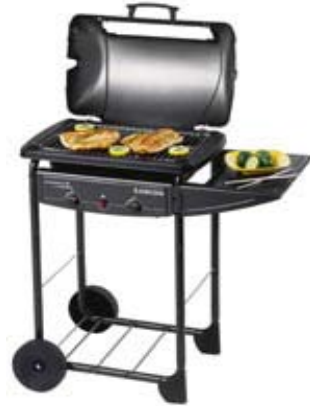
RANCHO PLUS - SUPER - CLASSIC